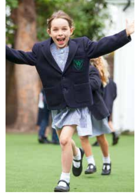
Left, the school's ethos is that children should be allowed to be children

What evidence do we have to prove that the Pupil Voice system works? Well, shepherd's pie is now officially off the lunch menu!