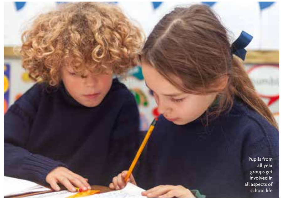
Pupils from all year groups get involved in all aspects of school life

attend, whether this be art, sport, music or drama. Pupils can either stick to their "Choice" throughout the whole school year, or change termly. Offering the children these choices is an excellent way of preparing them for their all-important 11+ exams, and means they can start working on an arts portfolio or honing their sports skills two years in advance. This removes a lot of the pressure they experience in the lead-up to the exams, and they are rewarded for it. The White House Prep's focus on Pupil Voice even extends to Junior and Senior Librarians and Playground Leaders, who work together with their peers and teachers to recommend new playground toys, games and books. These suggestions have led to the recent instalment of reading cabins in the garden, which have proven very popular. Pupil Voice listens to everyone in the school, to ensure nobody gets lost among